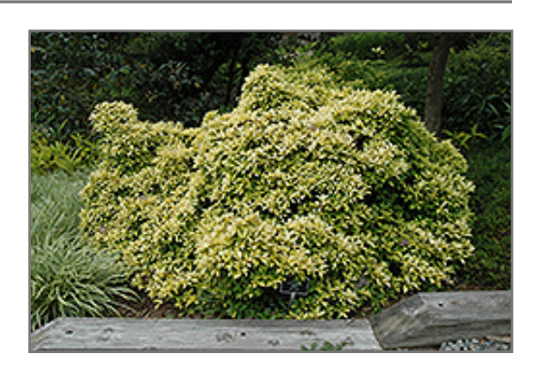
Goldenleaf False Holly