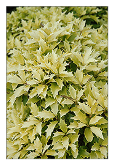
Goldenleaf False Holly foliage