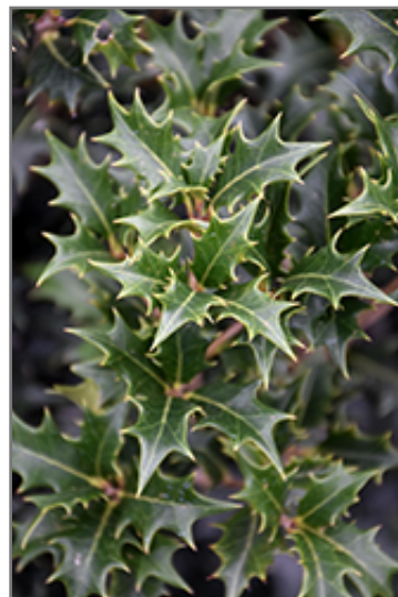
Gulftide False Holly foliage