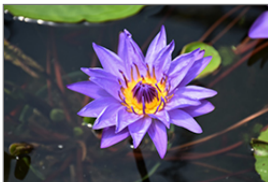
Director George T. Moore Tropical Water Lily flowers