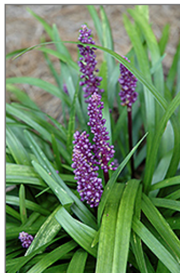
Royal Purple Lily Turf flowers