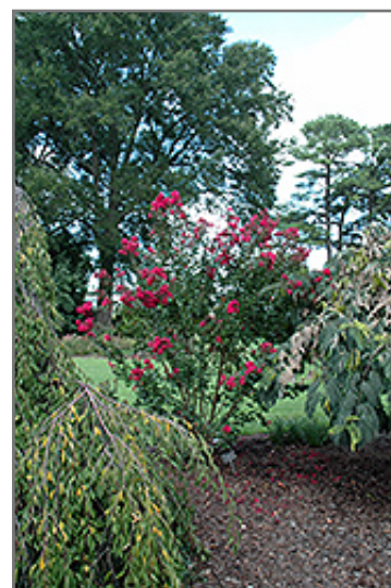
Pink Velour Crapemyrtle in bloom