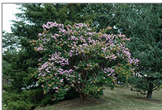
Yuma Crapemyrtle in bloom