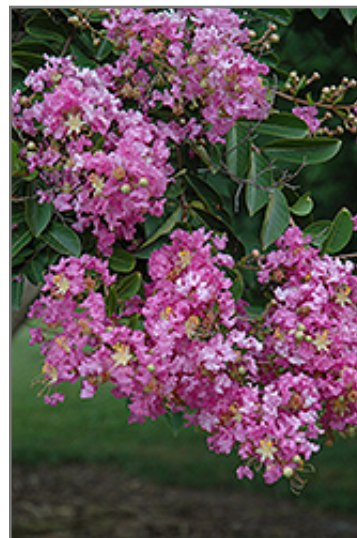
Lipan Crapemyrtle flowers