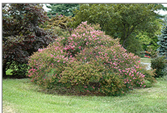
Caddo Crapemyrtle in bloom