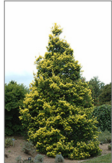
Sunny Foster Holly