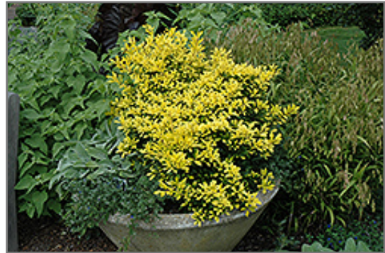
Sunny Foster Holly

This plant is not reliably hardy in our region, and certain restrictions may apply; contact the store for more information.