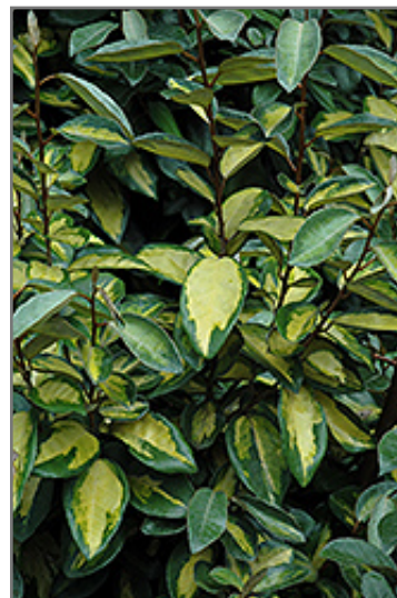
Limelight Silverberry foliage