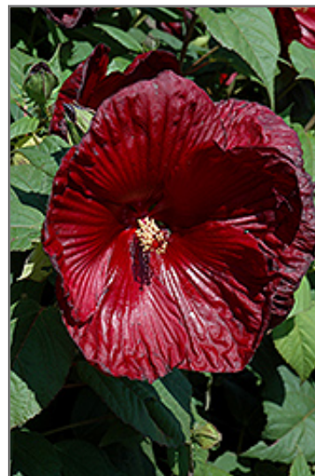
Heartthrob Hibiscus flowers