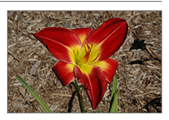
Cherokee Star Daylily flowers