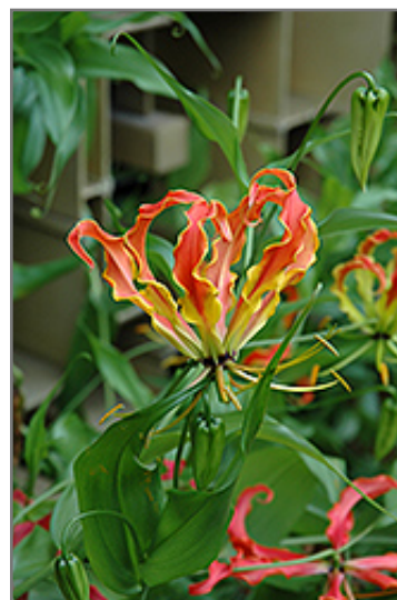
Gloriosa Lily flowers