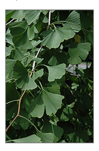
Ross Moore Ginkgo foliage

Ross Moore Ginkgo is recommended for the following landscape applications;