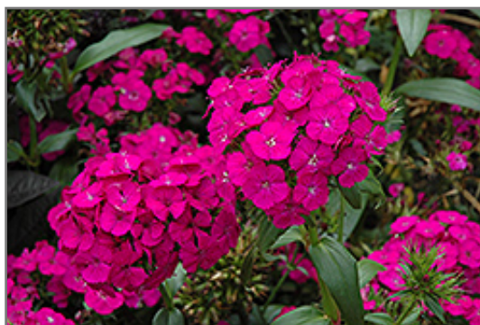
Amazon Neon Purple Pinks flowers

Amazon Neon Purple Pinks is recommended for the following landscape applications;