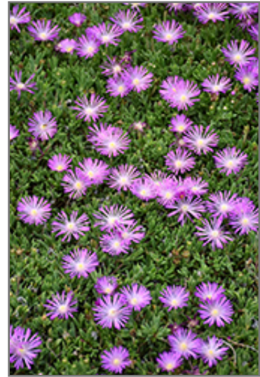
Table Mountain Ice Plant flowers

This plant is not reliably hardy in our region, and certain restrictions may apply; contact the store for more information.