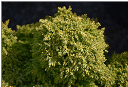
Twinkle Toes Japanese Cedar foliage