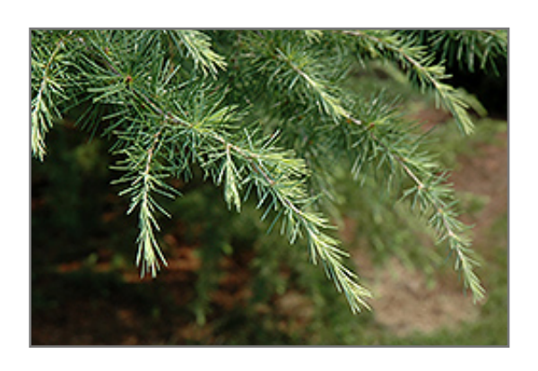
Blue Ice Deodar Cedar foliage

Blue Ice Deodar Cedar is recommended for the following landscape applications;