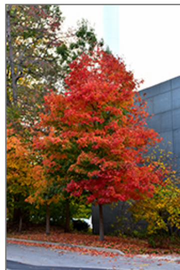
Fall Fiesta Sugar Maple in fall