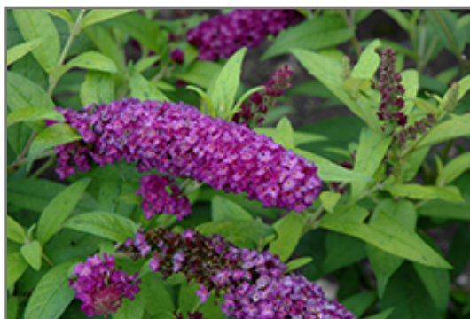
Monarch Crown Jewels Butterfly Bush flowers