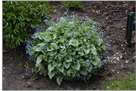
Sea Heart Bugloss in bloom

Sea Heart Bugloss will grow to be about 12 inches tall at maturity extending to 16 inches tall with the flowers, with a spread of 18 inches. When grown in masses or used as a bedding plant, individual plants should be spaced approximately 14 inches apart. It grows at a medium rate, and under ideal conditions can be expected to live for approximately 10 years. As an herbaceous perennial, this plant will usually die back to the crown each winter, and will regrow from the base each spring. Be careful not to disturb the crown in late winter when it may not be readily seen!