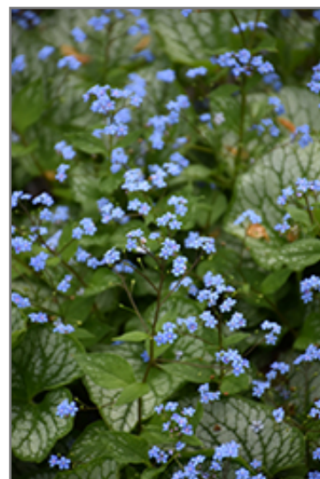
Sea Heart Bugloss flowers

Sea Heart Bugloss is recommended for the following landscape applications;