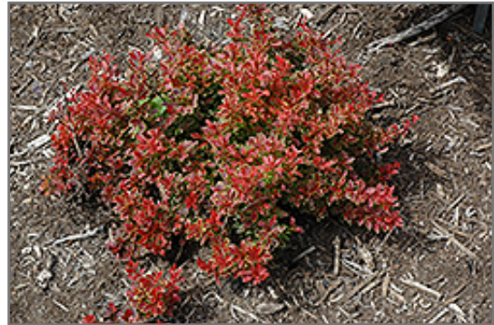
Lutin Rouge Japanese Barberry