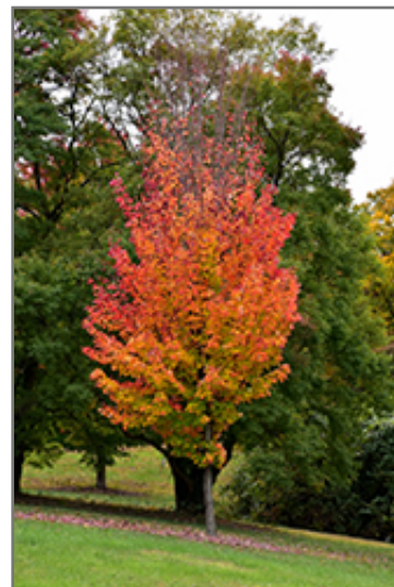
Red Rocket Red Maple in fall

Red Rocket Red Maple is recommended for the following landscape applications;