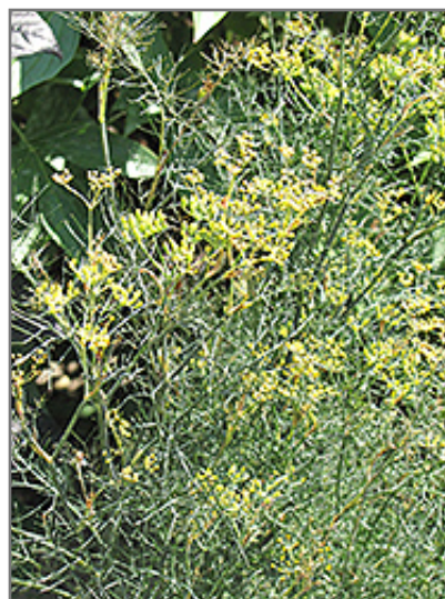
Bronze Fennel in bloom