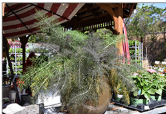
Bronze Fennel

Bronze Fennel has masses of beautiful yellow flat-top flowers held atop the stems in mid summer, which are most effective when planted in groupings. The flowers are excellent for cutting. Its attractive fragrant ferny leaves emerge burgundy in spring, turning bluish-green in colour with showy coppery-bronze variegation and tinges of purple throughout the season.