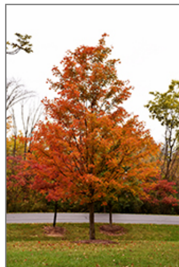
Norwegian Sunset Maple in fall