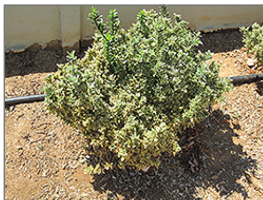
Variegated Boxleaf Japanese Euonymus