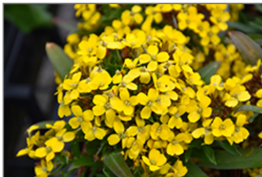
Canaries Wallflower flowers

Canaries Wallflower is recommended for the following landscape applications;