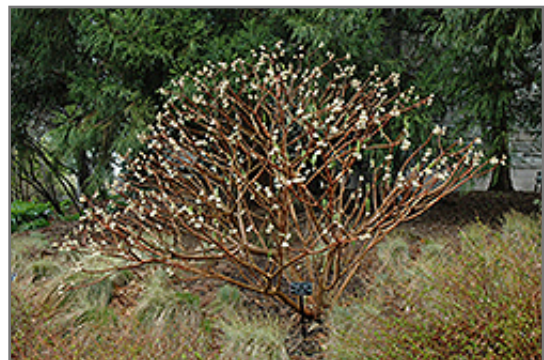
Snow Cream Oriental Paper Bush in bloom