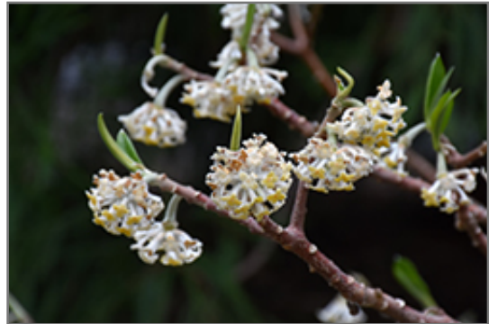
Snow Cream Oriental Paper Bush flowers

This plant is not reliably hardy in our region, and certain restrictions may apply; contact the store for more information.