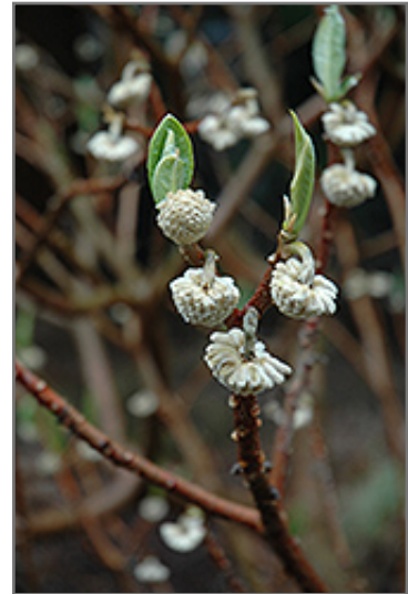
Snow Cream Oriental Paper Bush flowers