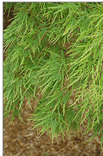
Cutleaf Japanese Maple foliage

Cutleaf Japanese Maple is recommended for the following landscape applications;