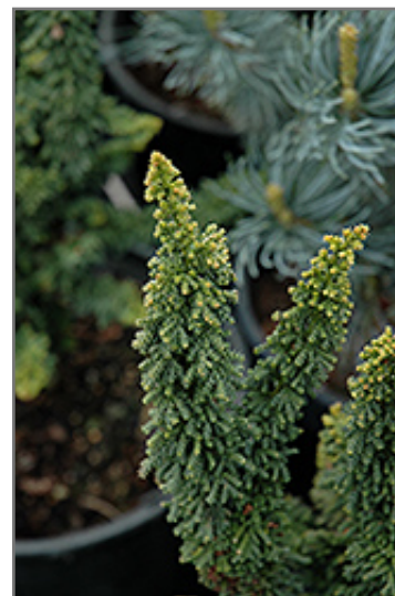
Chirimen Hinoki Falsecypress foliage