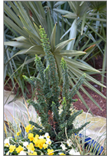
Chirimen Hinoki Falsecypress

This plant is not reliably hardy in our region, and certain restrictions may apply; contact the store for more information.