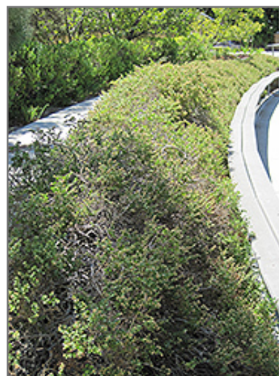
Pigeon Point Coyote Brush