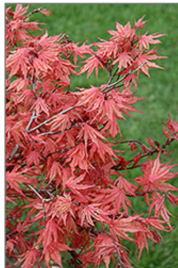
Kasagi Yama Japanese Maple foliage