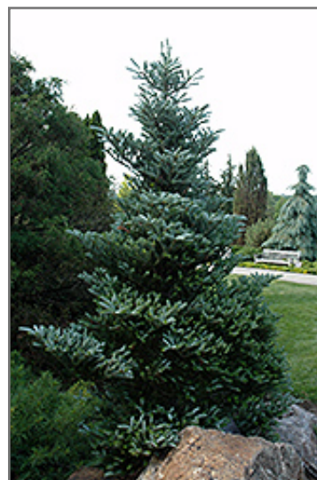
Silver Snow Korean Fir