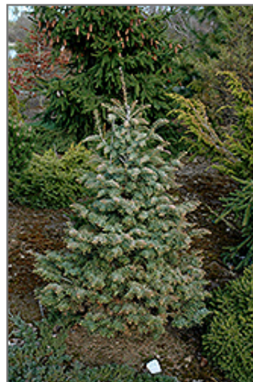
Archer's Dwarf White Fir

Archer's Dwarf White Fir will grow to be about 10 feet tall at maturity, with a spread of 4 feet. It tends to fill out right to the ground and therefore doesn't necessarily require facer plants in front, and is suitable for planting under power lines. It grows at a slow rate, and under ideal conditions can be expected to live for 80 years or more.