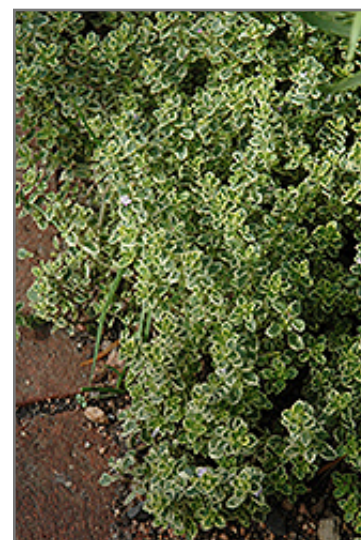
Aureus Lemon Thyme foliage