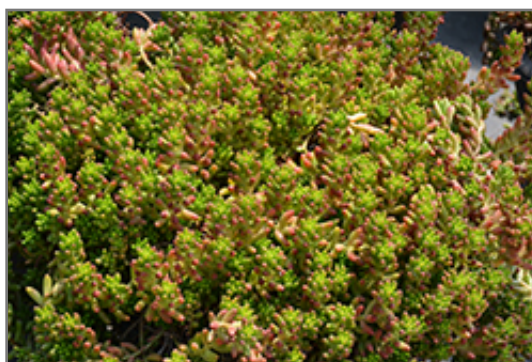
Jelly Bean Plant