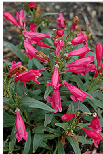
Pinacolada Red Beard Tongue flowers