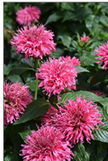
Bubblegum Blast Beebalm flowers

Bubblegum Blast Beebalm is recommended for the following landscape applications;