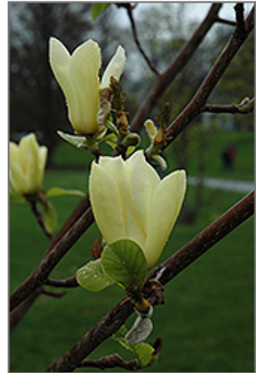
Golden Pond Magnolia flowers

Golden Pond Magnolia will grow to be about 25 feet tall at maturity, with a spread of 20 feet. It has a low canopy with a typical clearance of 3 feet from the ground, and is suitable for planting under power lines. It grows at a medium rate, and under ideal conditions can be expected to live for 50 years or more.