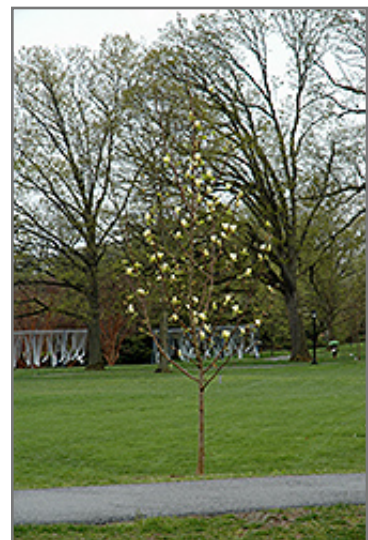
Golden Pond Magnolia in bloom