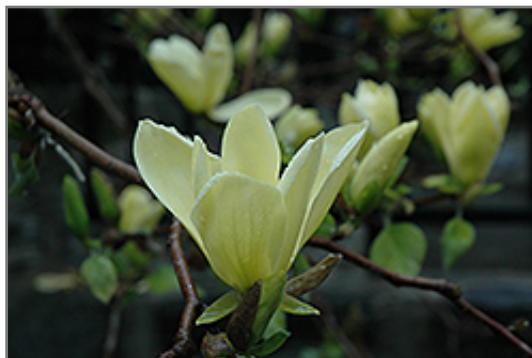
Golden Gift Magnolia flowers

Golden Gift Magnolia will grow to be about 25 feet tall at maturity, with a spread of 20 feet. It has a low canopy with a typical clearance of 2 feet from the ground, and is suitable for planting under power lines. It grows at a medium rate, and under ideal conditions can be expected to live for 50 years or more.