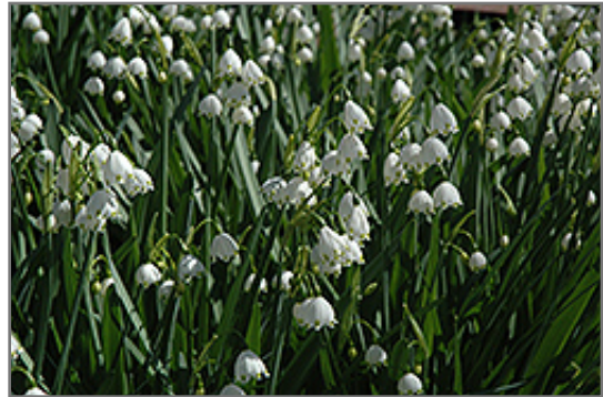
Gravetye Giant Summer Snowflake flowers