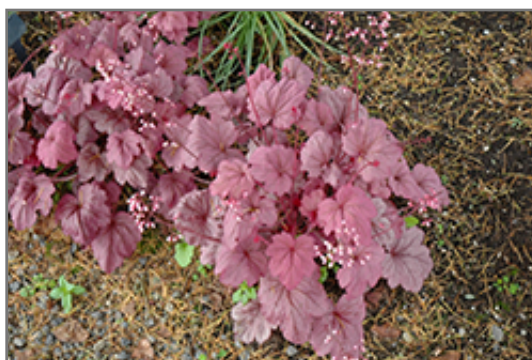
Georgia Plum Coral Bells