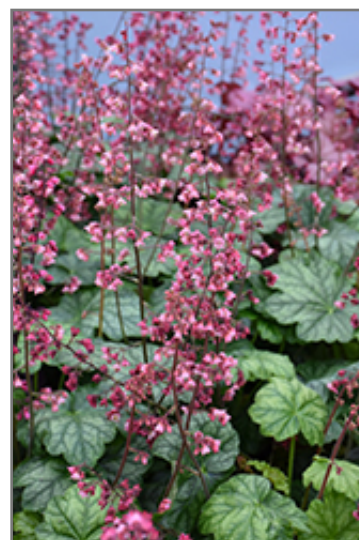
Berry Timeless Coral Bells flowers