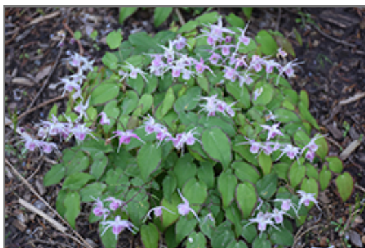
Queen Esta Bishop's Hat in bloom

Queen Esta Bishop's Hat is recommended for the following landscape applications;