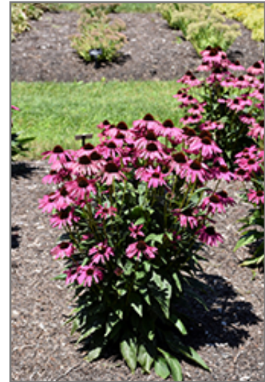
Butterfly Purple Emperor Coneflower in bloom

This plant is not reliably hardy in our region, and certain restrictions may apply; contact the store for more information.