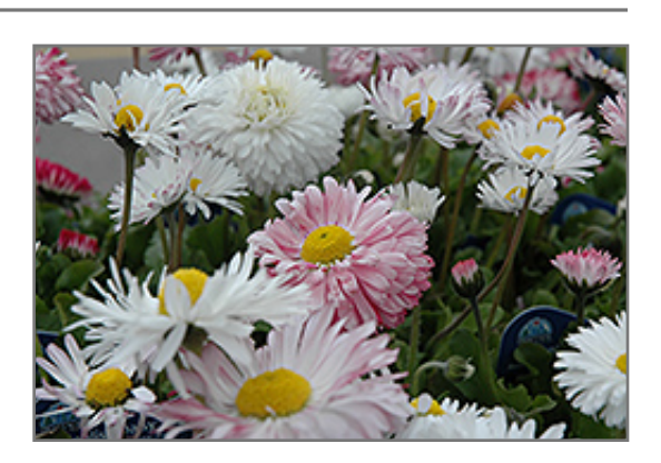
Super Enorma English Daisy flowers