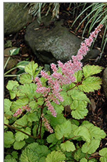
Amber Moon Chinese Astilbe flowers