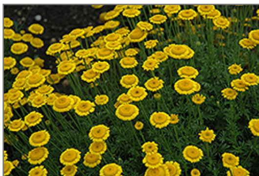
Charme Marguerite Daisy flowers