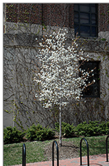
Snowcloud Serviceberry in bloom