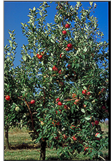
Zestar Apple fruit

This plant is not reliably hardy in our region, and certain restrictions may apply; contact the store for more information.