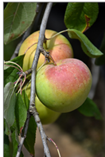
Zestar Apple fruit

Zestar Apple features showy clusters of lightly-scented white flowers with shell pink overtones along the branches in mid spring, which emerge from distinctive pink flower buds. It has forest green deciduous foliage. The pointy leaves turn yellow in fall. The fruits are showy red apples with hints of yellow, which are carried in abundance from late summer to early fall. The fruit can be messy if allowed to drop on the lawn or walkways, and may require occasional clean-up.